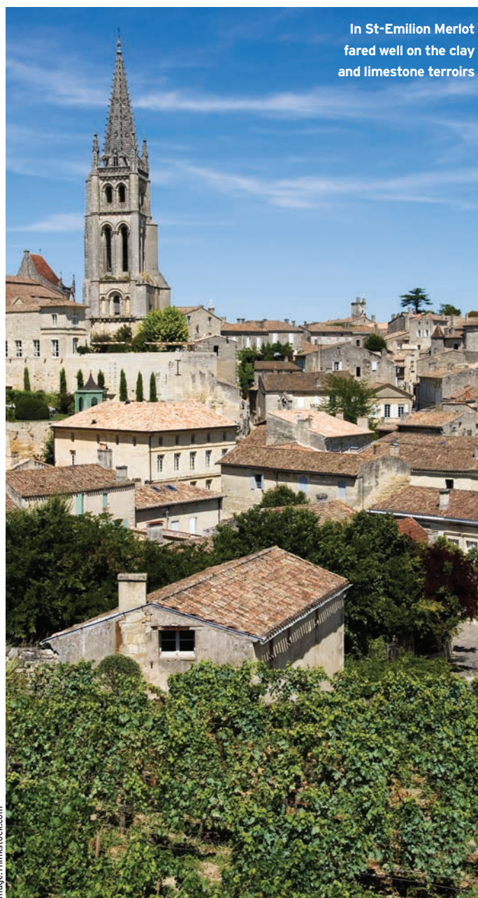
In St-Emilion Merlot fared well on the clay and limestone terroirs