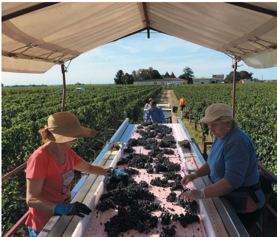
Top; Sorting table in the vineyard at Vieux Château Certan

My top wines from these appellations above are listed over the page. There are some values to be found. Less expensive yet delicious wines can be found in volume in the Haut-Médoc, the Médoc, St-Estèphe, Moulis and Listrac on the Left Bank, as well as in the Graves and other estates in