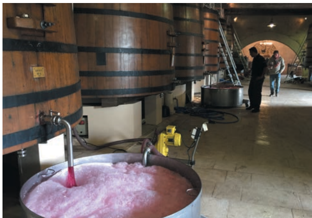
Above: Château Léoville Barton. A uniformly great vintage for St-Julien

Pessac-Léognan. On the Right Bank, 2016 was successful in Fronsac and Canon Fronsac, for Lalande de Pomerol, and for Saint Emilion and its satellites. Plenty of excellent wines on the Côtes de Bordeaux as well, and at Bordeaux Supérieur level.