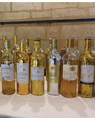
↑ CHÂTEAU PICHON BARON; TASTING SAUTERNES AND BARSAC

"There is a lightness of touch being demonstrated in Bordeaux these days and it's most welcome"